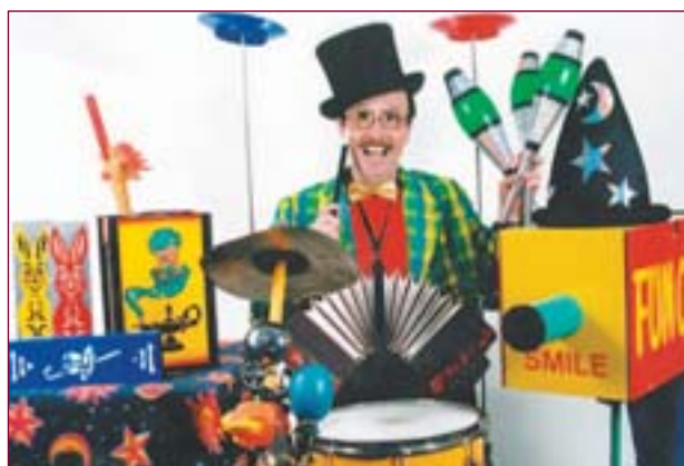
The Wacky Woz is scheduled to perform at Kids Day.

The "Wacky Woz" is scheduled to perform at this year's event. Woz is a versatile vaudeville variety artist who provides fun for all ages. His