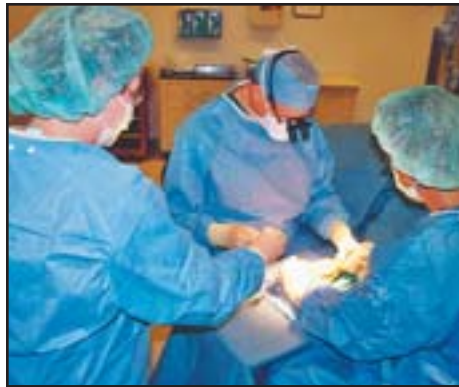
Carpal tunnel release is one of many surgical procedures available at Moundview.

Sue’s experience is typical of those who have carpal tunnel syndrome. The carpal tunnel is a narrow tunnel on the palm side of your wrist that protects the “median nerve” which