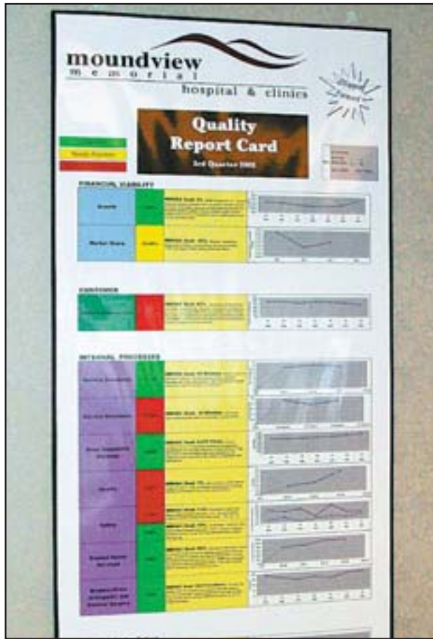
Example of a quality report card at Moundview Memorial

Care Satisfaction” taken from patient surveys. In order to assure that MMH&C is achieving its vision of becoming the preferred local healthcare provider by exceeding customer expectations, patient satisfaction will be measured regularly to assess a variety of services provided.